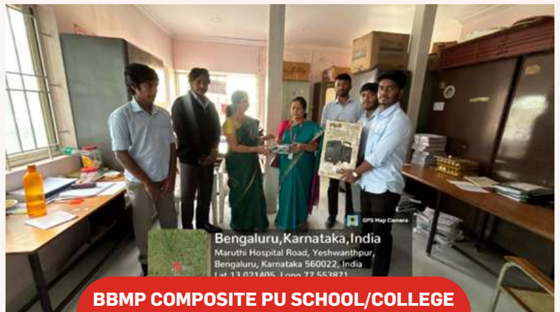
BBMP COMPOSITE PU SCHOOL/COLLEGE 21-02-2025