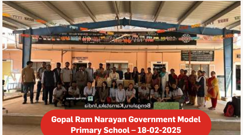
Gopal Ram Narayan Government Model Primary School – 18-02-2025

Our B-School is committed to giving back to the community through various service-to-society initiatives. These efforts aim to foster social responsibility and a spirit of volunteerism among students. From organizing awareness campaigns on important issues like health, environment, and education to participating in community-building activities, our students actively contribute to the betterment of society. The initiatives provide hands-on opportunities for students to engage with and understand the challenges faced by underserved communities while developing their leadership, teamwork, and problem-solving skills. Through these programs, we aim to create a positive impact and inspire a culture of giving and social consciousness.