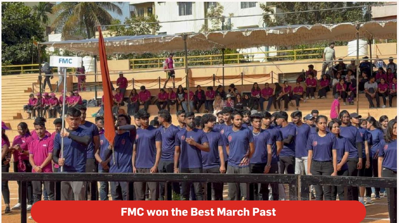
FMC won the Best March Past