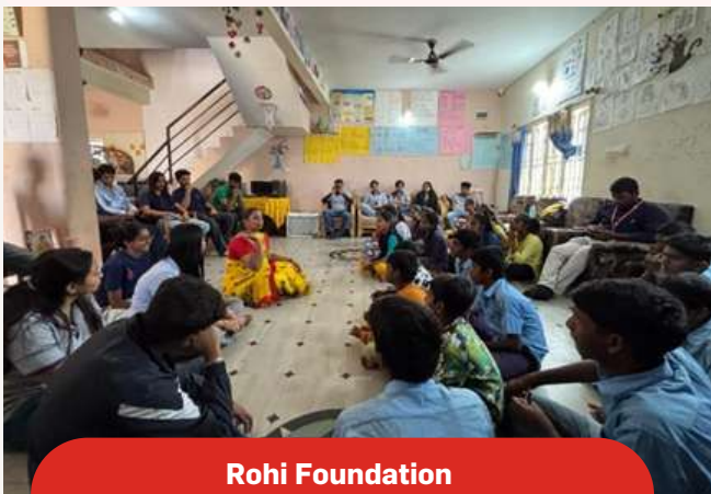
Rohi Foundation 7-02-2025

Our B-School is committed to giving back to the community through various service-to-society initiatives. These efforts aim to foster social responsibility and a spirit of volunteerism among students. From organizing awareness campaigns on important issues like health, environment, and education to participating in community-building activities, our students actively contribute to the betterment of society. The initiatives provide hands-on opportunities for students to engage with and understand the challenges faced by underserved communities while developing their leadership, teamwork, and problem-solving skills. Through these programs, we aim to create a positive impact and inspire a culture of giving and social consciousness.