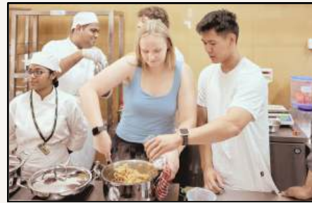
A taste of India — German students exploring the art of Indian cooking