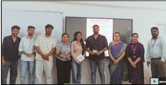
'Laugh & Small Funny Challenges' held on 1 st July 2025