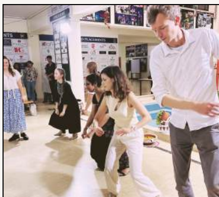
Stepping to the rhythm — German students learning traditional Indian dance moves