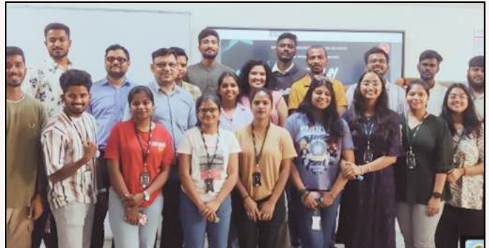
'Power Play' held on 4 th July 2025