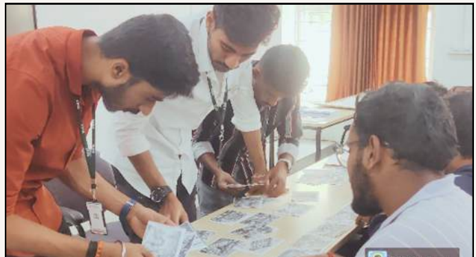
'Building Retail Strategy' held on 25 th July 2025