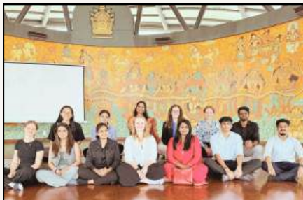
Finding balance — German students experiencing holistic wellness at a Yoga Centre