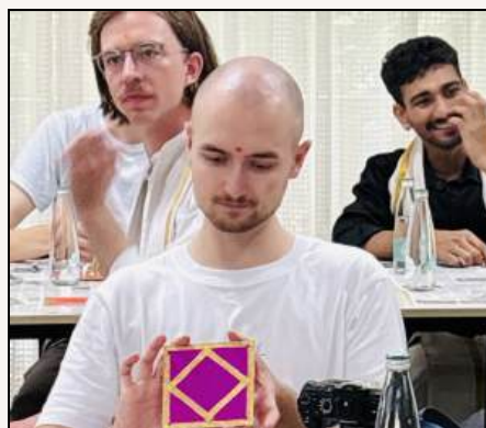
Creativity in action — German students getting hands-on with traditional Indian crafts