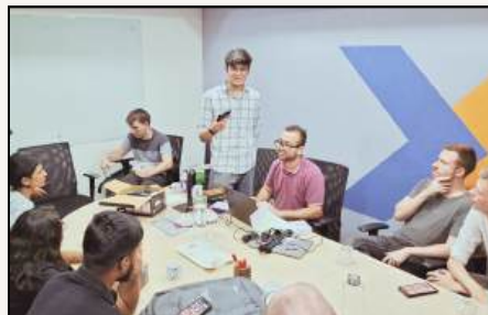
German students collaborating on an exciting mini project