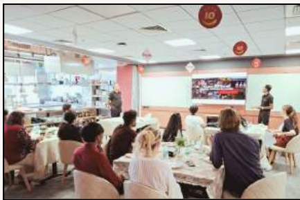
Engaged and inspired — German students immersed in a presentation during industrial visit

The German BayIND Summer School 2025 offered a dynamic week-long program featuring a rich blend of activities. Highlights included an expert lecture series, guest talks, mini project work, industrial visits, and vibrant cultural exchange sessions such as learning traditional dance moves and cooking Indian delicacies. All activities were thoughtfully aligned with the central theme, providing participants with both valuable academic and industry insights, as well as deep, meaningful cultural experiences. Given here a photo gallery of various activities in which they participated.