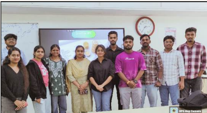
'Pictionary' held on 25 th July 2025