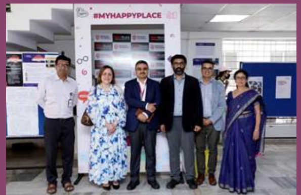
International Visitors at FMC From Australia