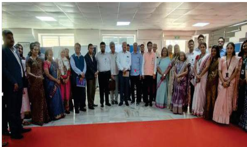
Successful NAAC PEER TEAM Visit to FMC - First Cycle on 28 May 2024