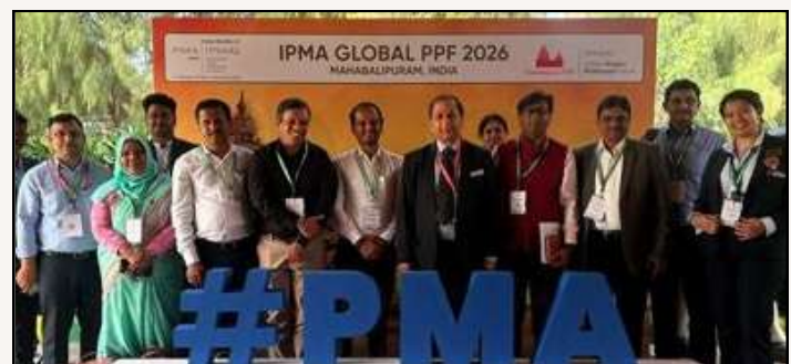
FMC participated in IPMA Global Project Professionals Forum 2026 held on 13-14 February 2026 at Radisson Blu Resort, Temple Bay, Mahabalipuram