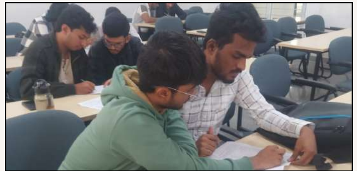
The Smart Accountant , MBA Section C (9th January 2026)