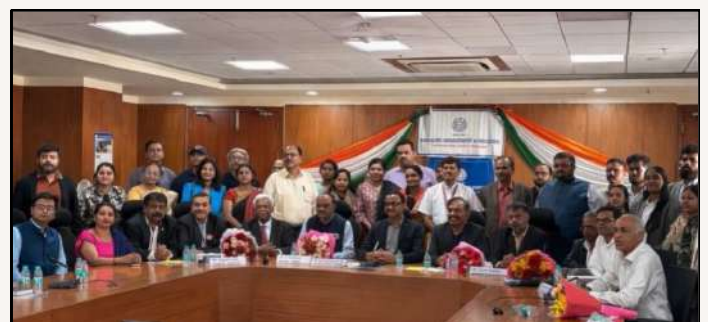
FMC participated in BMA Symposium on "AI and the Future of Management Education & Practice – Aligning Education, Employment & Employability" on 17 Jan. 2026 at Belaku Bhavana, Bengaluru