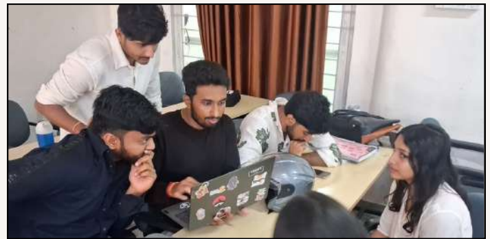
Clash of Convictions: A battle of Belief's begins here , MBA Section B (9th January 2026)