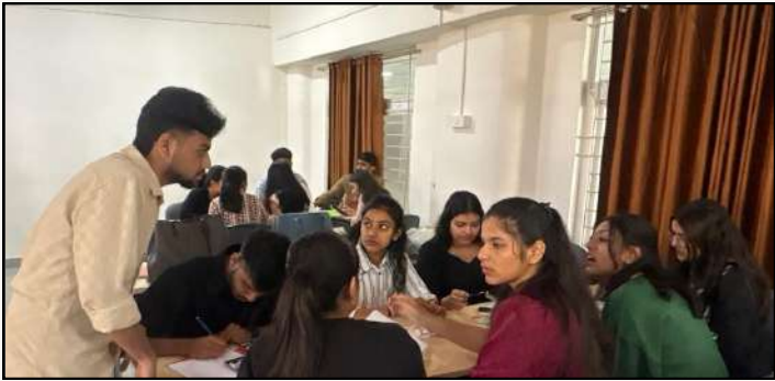
Greeting Card Challenge , MBA Section A (9th January 2026)