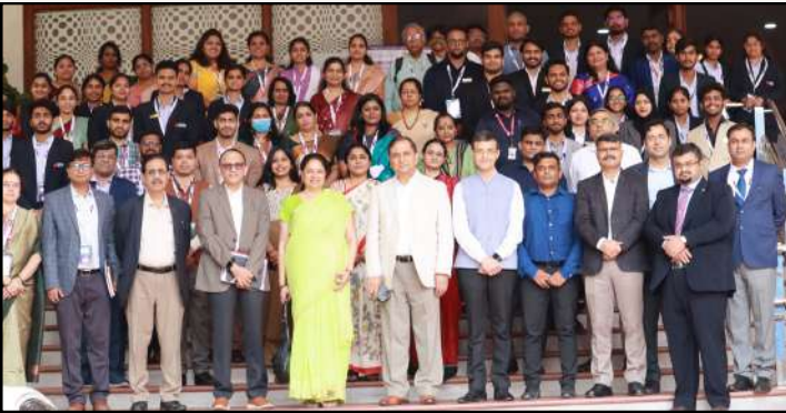
National Conference on GST Reforms 2.0