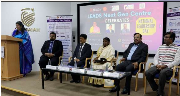
NATIONAL LEADERSHIP DAY 2026