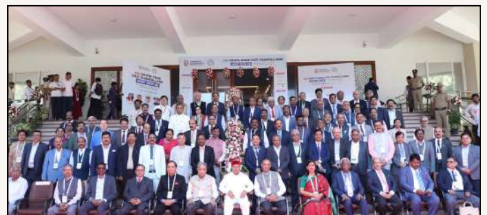
FMC participated in AIU South Zone Vice Chancellors' Meet 2025-26 held on 20-21 January 2026 at Ramaiah University of Applied Sciences