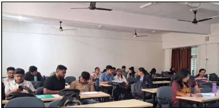
The Recruitment Lab: Dual Roles, Real Skills , MBA Section B (6th February 2026)