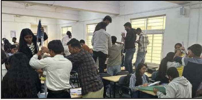
Marshmallow Tower Challenge , MBA Section D (9th January 2026)