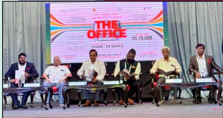
NATIONAL MANAGEMENT DAY 2026