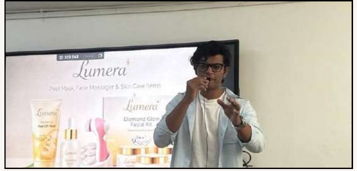
Pitch Perfect: Brand Edition , MBA Section C (6th February 2026)