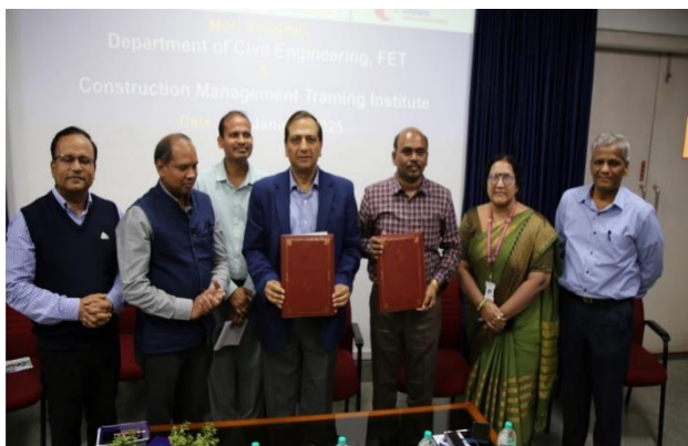
MoU Protocol signed with CMTI

CMTI collaboration has helped Practical exposure, Enhanced expertise, Entrepreneurial opportunities and improved curriculum to students.