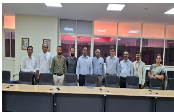
State University of New York at Stony Brook, December 23 rd 2024