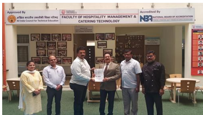
MoU with Vishaal Natural Food Products