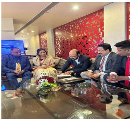
MoU with Radisson Blu