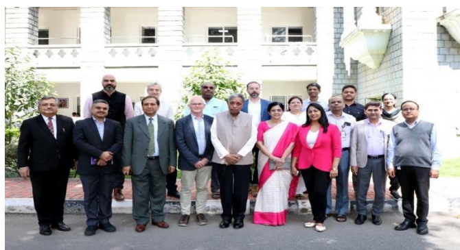
Australian National University Delegation – Nov. 20 th 2024

During the year 2024-2025 collaboration with International and National were established. In International- State University of New York, Johns Hopkins University and in National level, 3 from Academics and 5 from Industry MoU have been signed. Australian National University Delegation team visited RUAS on Nov 20 th , 2024.