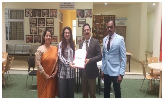
MoU with Adevo Academy

An International MoU was signed with Vira International Limited, London for Cultural Exchange and Practical Training experiences for graduates & undergraduates of the University. Free Workshops, Seminars, Internship programs for students.