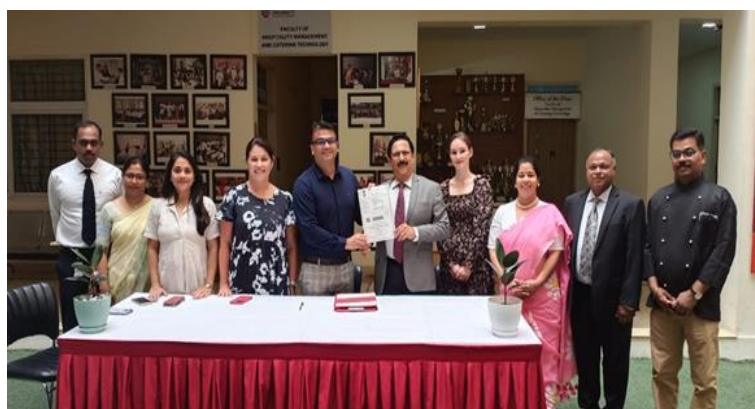
MoU with Vira International Limited, London

An International MoU was signed with Vira International Limited, London for Cultural Exchange and Practical Training experiences for graduates & undergraduates of the University. Free Workshops, Seminars, Internship programs for students.