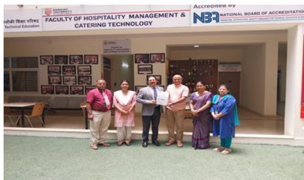
MoU with Green Path Eco Hotel