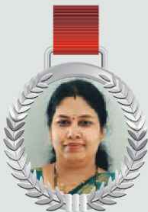
RINER-M.SC in CHN SUNITHA A 23NGPD167001