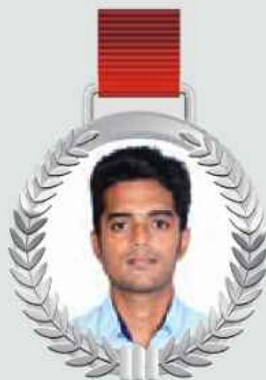
FAD-M.Des in PD C K ADITH 23ADID041001