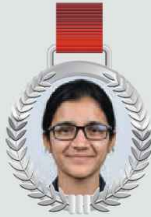
SOSS-B.SC in DSA TINA J JAT 21SSDS415017