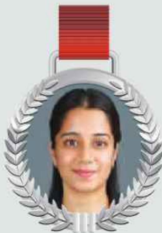
SSS-MA in PP PARANGE RIYA 23SSPP103003