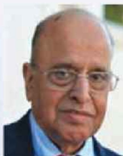
Dr. K. Kasturirangan, Ex-Chairman, Indian Space Research Organisation