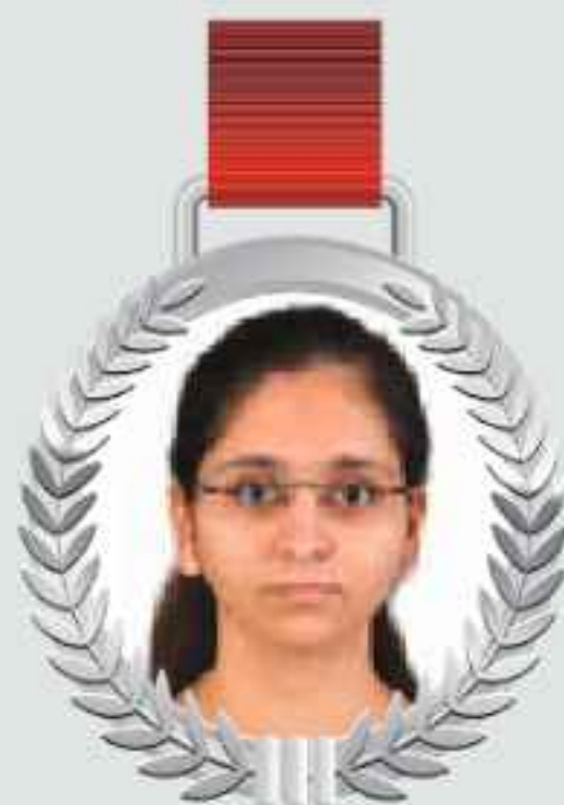
RCPT-MPT in PEDIA SWATI ARUN MISKIN 23MPT1660003