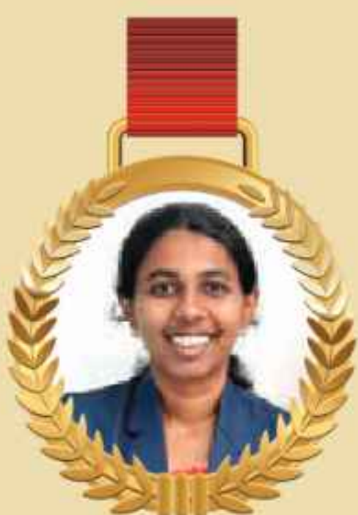
FLAHS-MSc in FST S NIRTHIKA 23LAFT093021