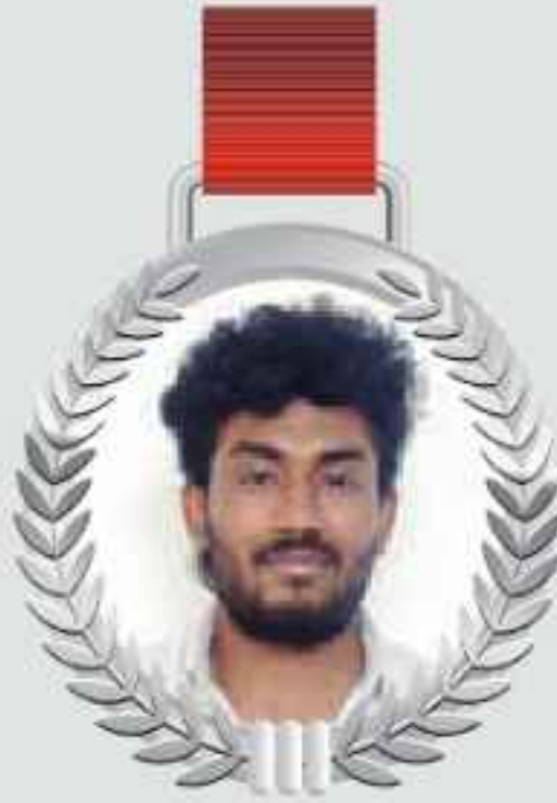
FAD-BD in PD SELVA SEKAR S 21ADID006021