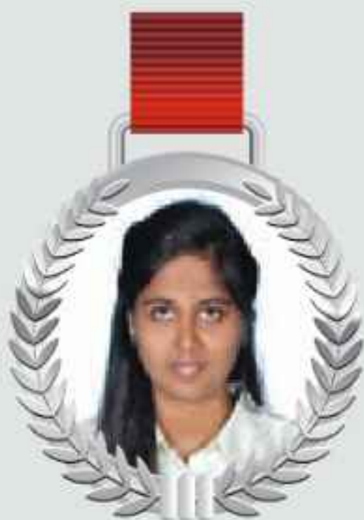
FAD-M.Des in FD YASIKA C 23ADFD045004