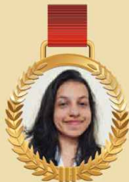
FLAHS-MSC in BT MOBASSHARA UZMA 23LABT091014