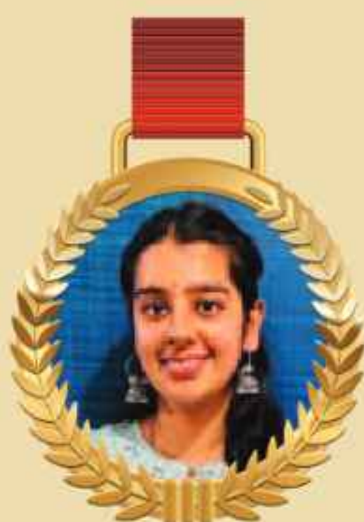
FLAHS-MSc in FND ABHIGNA S 23LAFN106001