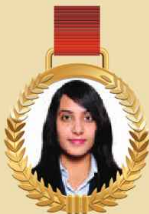
FMC-MBA RAKSHA M 23MCMS101149