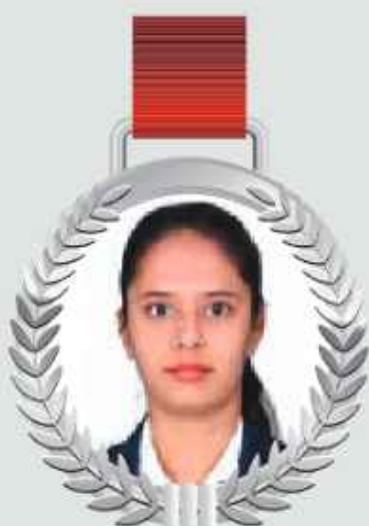
FPH-MP in PC RAKSHITHA N 23PHPY057010