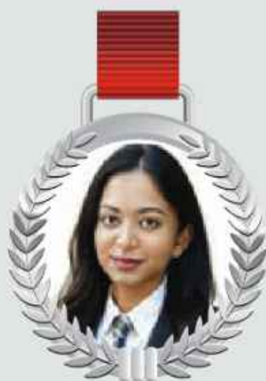
FMC-BBA in FM MINNU TOM 22MCMS017098