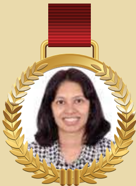
FET-B.Tech in ASE T GRISHMA 20ETAS012042