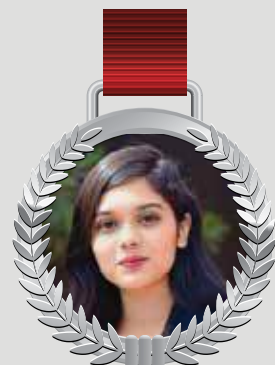
FET-B.Tech in RE ZEB SANIA R 20ETRE409030