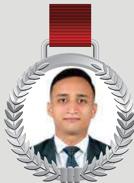
FHMCT-BHM CHANDAN N D 20HCBH008021