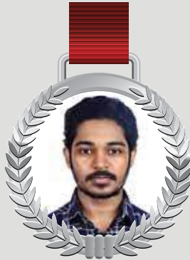
FAD-B.Des in PD ACHYUTH. K 20ADID006002