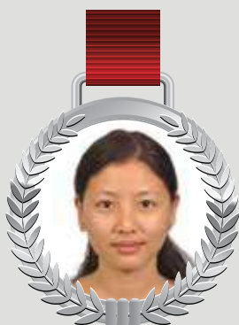
RINER-P.B.B.Sc NEIZENGUNO KHRO 22NGPB441009