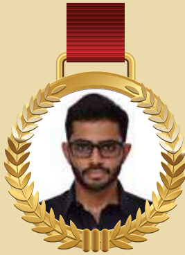
FET-B.Tech in MC G GAGAN 20ETMC412002