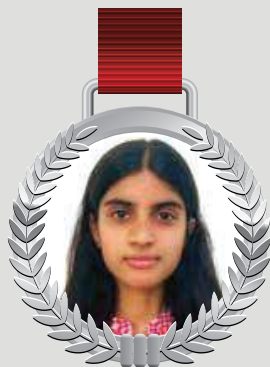
FLAHS-B.Sc in FT PAVANA B R 21LAFT019041