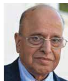
Dr. K. Kasturirangan, Ex-Chairman, Indian Space Research Organisation