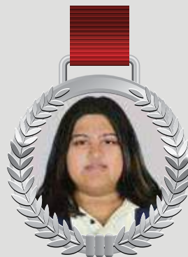
FMC-B.Com in AF PREETHI N 21MCCA016032