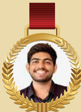
FET-B.Tech in MME ASHRAY A 20ETME005005