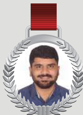
SSS-MA in PP SAMEERA M 22SSPP103005