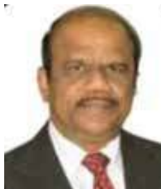
Dr. Sivathanu Pillai Honorary Distinguished Professor, Indian Space Research Organisation