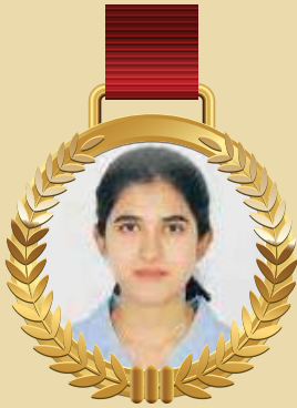
FLAHS-M.Sc in FND INCHARA A 22LAFN106009