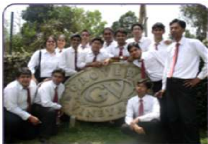
Industry / Field Visits- Vineyards & Eco-Friendly Resorts