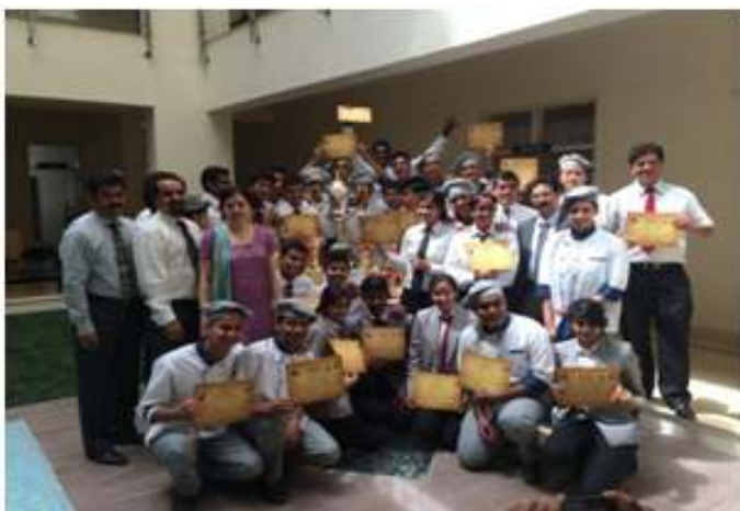
Student Competitions and Exhibitions