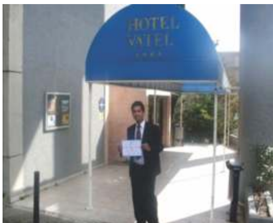
Park Hyatt Beaver Creek, Colorado 8100- Restaurant

The FHMCT-MSRUAS provides opportunity for students to take up International Internships during their course in places like Vatel-France. Students are placed for internship in Europe, USA, Australia and the Middle East.