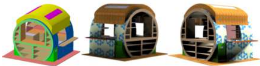
Rendered final concept