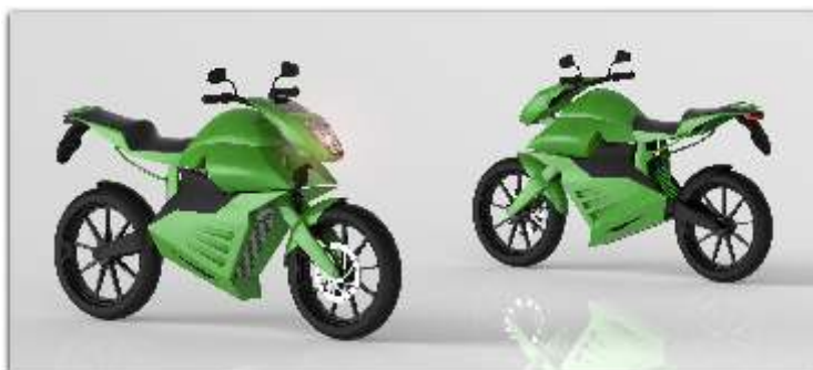
Digital model of final concept